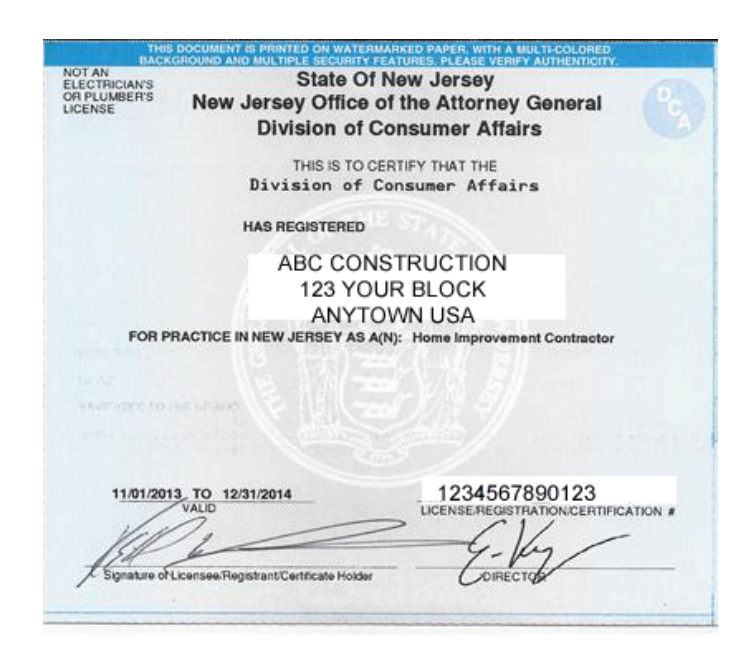
Sample Contractor Trade License

All bidders are to submit with their proposal all current, valid contractor or trade licenses as issued by the New Jersey Division of Consumer Affairs, for any trade or specialty area the contractor seeks to perform work for this particular proposal.